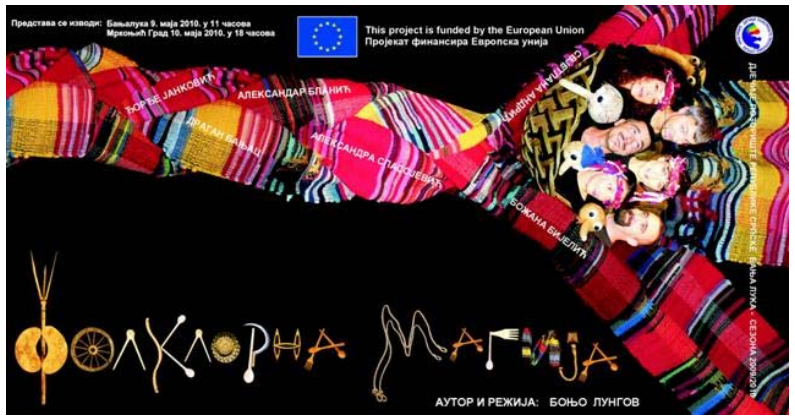
Folklore Magic poster

In order to teach children tolerance, respect of differences and informing them about the EU, the Kid's Theatre of Republika Srpska organised and performed a theatre play "Folkorna magija" on 9 May in Banja Luka and on 10 May in Mrkonjic Grad. Close to 8000 children had an opportunity to enjoy in the performance given by the renowned Kid's theatre and especially in Mrkonjic Gard where there are hardly any plays performed in the recent history.