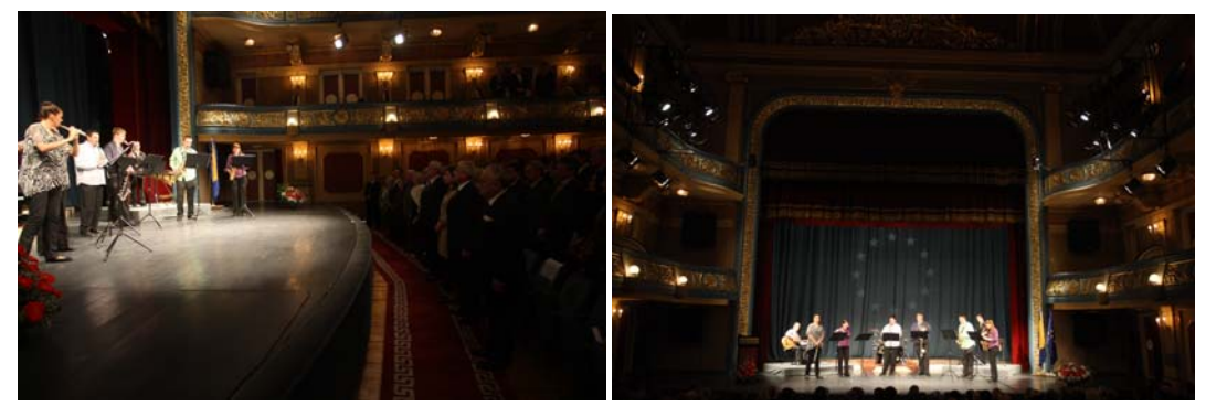
"Winds of Change" ensemble

In the evening of 10 May 2010 a Europe Day Concert followed by reception was held in the National Theatre Sarajevo, gathering representatives of local authorities, international