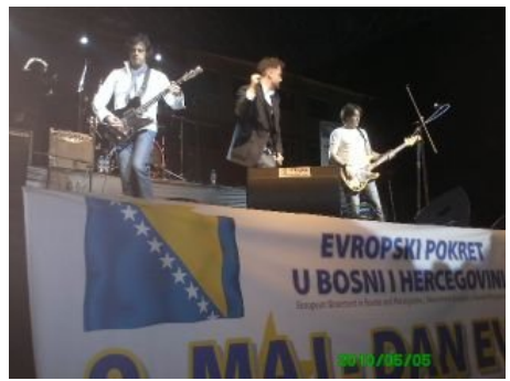
Concert by REGINA