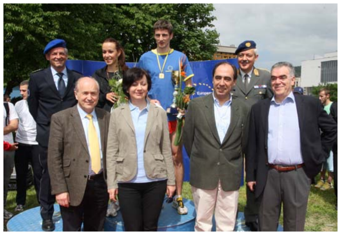
Heads of EU Missions in BiH and DEI Director with the winners of the race

The race was a great success with total of 524 participants, which is more than in previous year being an absolute record of any single short distance race in BiH. The competitors included university and high-school students, primary-school pupils, representatives of athletic clubs from BiH and region and ordinary citizens. If googled, the race "Run to Europe" can be found on more than 100 web sites, both in local and in English language. The top three finishers in the men's and women's categories were awarded with the Run to Europe medals. On this occasion billboards and posters were placed in the town to attract more participants while specially designed T-Shirts were distributed to all those who finished the race. The interest of citizens was large and it was excellent opportunity to distribute the EU promotional material to citizens.