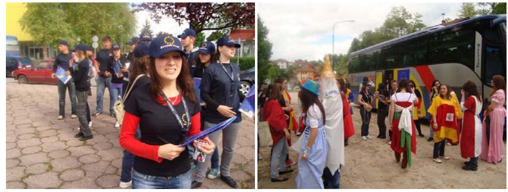
Students distributing EU promotional material EU bus and students ready for EU mask ball

The following activities took place in Doboj area: