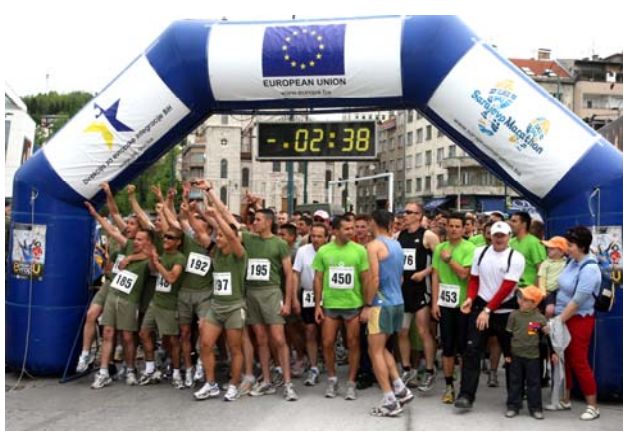
Start of the race

The race was a great success with total of 524 participants, which is more than in previous year being an absolute record of any single short distance race in BiH. The competitors included university and high-school students, primary-school pupils, representatives of athletic clubs from BiH and region and ordinary citizens. If googled, the race "Run to Europe" can be found on more than 100 web sites, both in local and in English language. The top three finishers in the men's and women's categories were awarded with the Run to Europe medals. On this occasion billboards and posters were placed in the town to attract more participants while specially designed T-Shirts were distributed to all those who finished the race. The interest of citizens was large and it was excellent opportunity to distribute the EU promotional material to citizens.